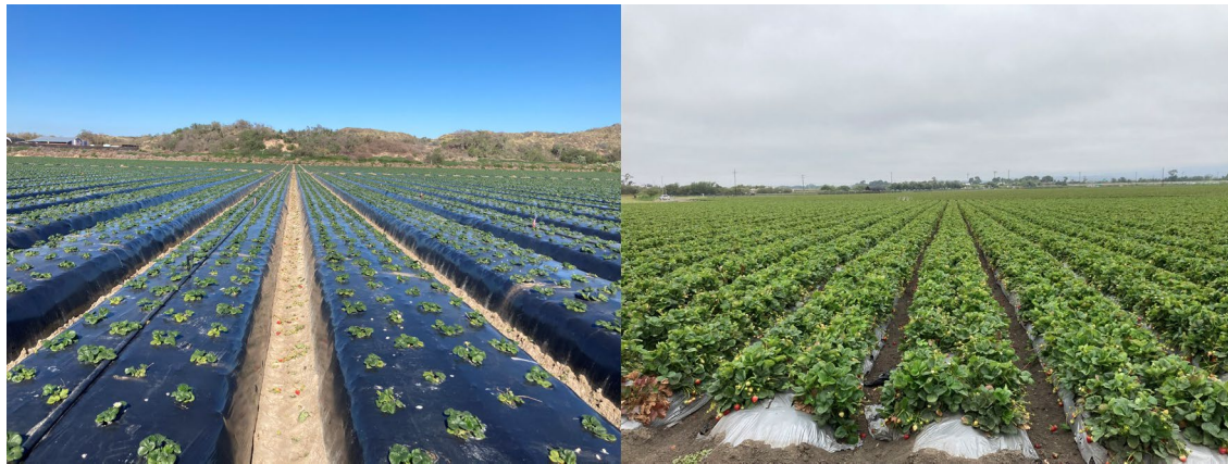
Figure 1. Pictures of a four-row production system in Santa Maria, CA in late January (left) and a two-row production system in Salinas, CA in July (right).